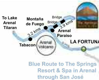
Blue Route to The Springs Resort & Spa in Arenal through San José

Take the Pan-American Highway towards the International Airport and take the Alajuela exit. Continue straight on this road for 12 miles following the signs for Poás Volcano. At the dead end three-way intersection where you see Jaulares Restaurant take a right. Proceed for one mile to the town of Poasito and make another right at the intersection where it says Heredia – Vara Blanca – Sarapiquí. Make a left at the gas station at Vara Blanca and proceed for 3 miles. Waterfall Gardens is on the left.